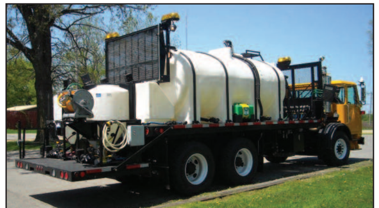
2700 Gallon Unit