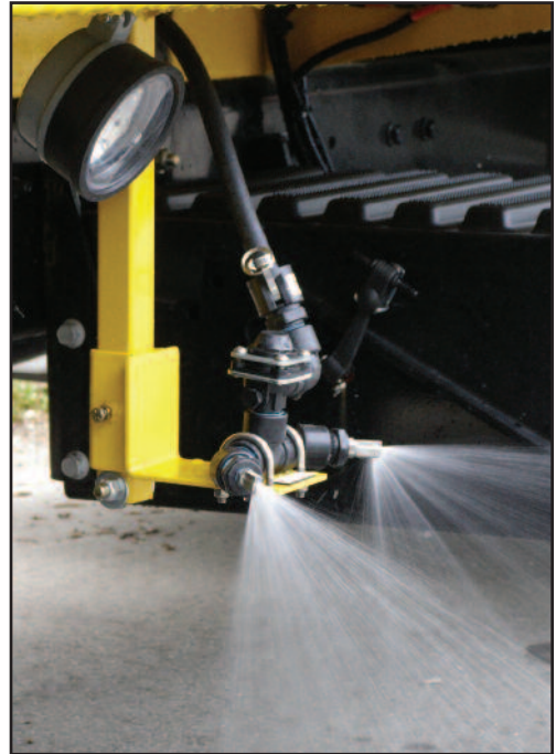
Guard Rail Underbody Spray Booms Manual or Power Height Adjustable. Optional Spot Light Shown