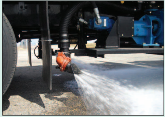
Street Flusher System