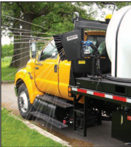
Spray Head: Front, Mid or Rear Mounted. Multi-Zone Spray Load with 30° Linear Actuation Tilt to Follow Ground Contour.