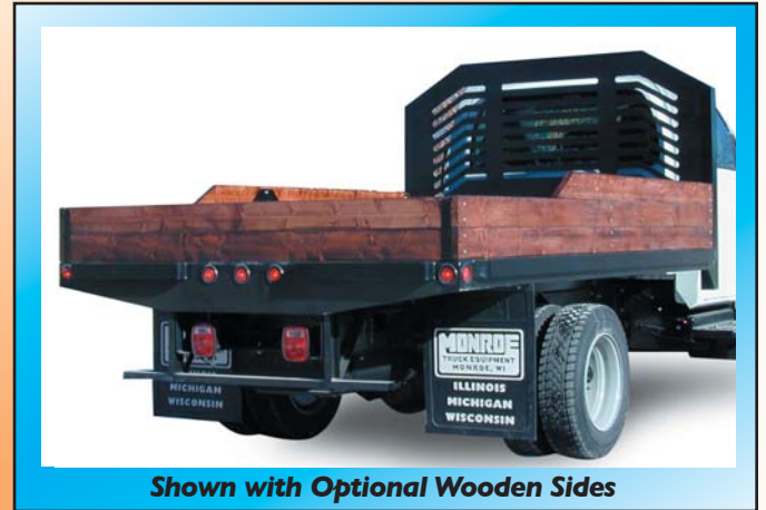
Shown with Optional Wooden Sides