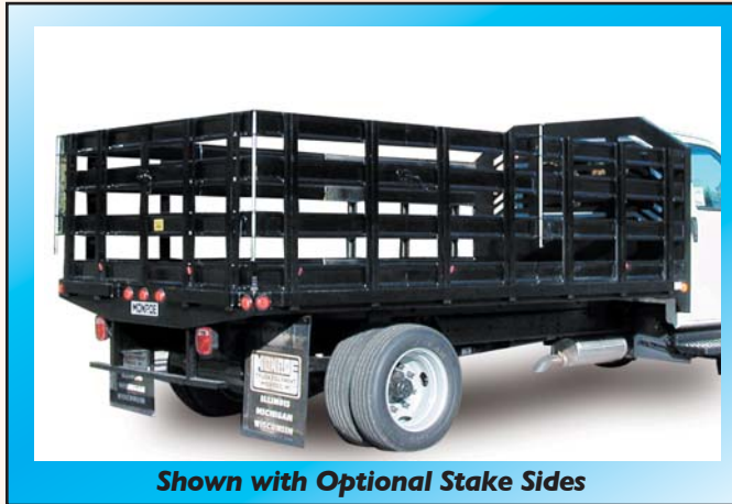
Shown with Optional Stake Sides