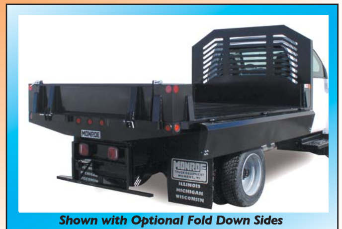
Shown with Optional Fold Down Sides