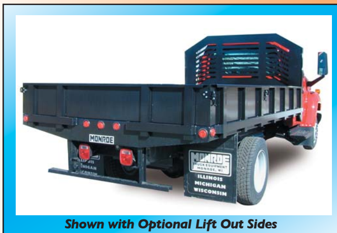
Shown with Optional Lift Out Sides