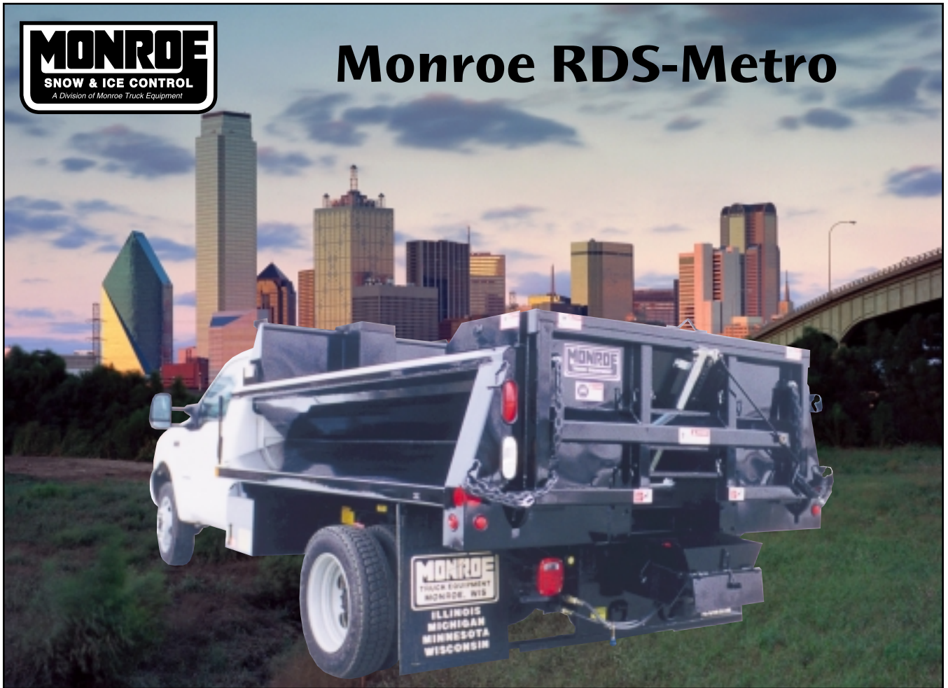
Combination Dump Body/Spreader designed for use with all kinds of materials. A multi-purpose body for the 17,500 - 19,000 pound GVW chassis.