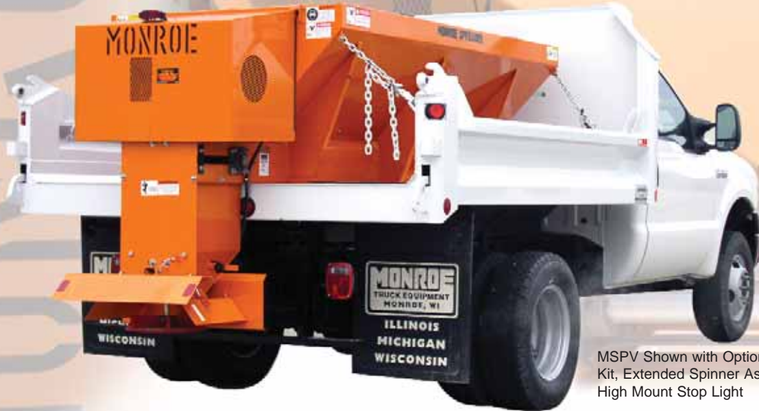
MSPV Shown with Optional Binder Hold Down Kit, Extended Spinner Assembly and Center High Mount Stop Light

Available for a wide variety of applications including: parking lots, intersections, schools, parks, alleys, apartment complexes, shopping malls, bridges and ramps, manufacturing plants, and much more!