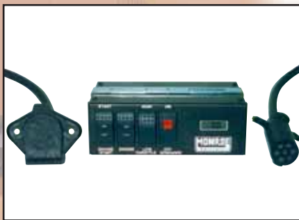
Optional Deluxe Throttle Control.