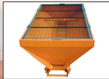
Optional 1/4" or 3/8" rod, set-in top screen.

Manufactured by: Monroe Snow & Ice Control 1051 W. 7th Street • Monroe, WI 53566 800-880-0109 • 608-329-8105 608-328-8390 Fax Web: monroetruck.com E-mail: snowandicecontrol@tds.net