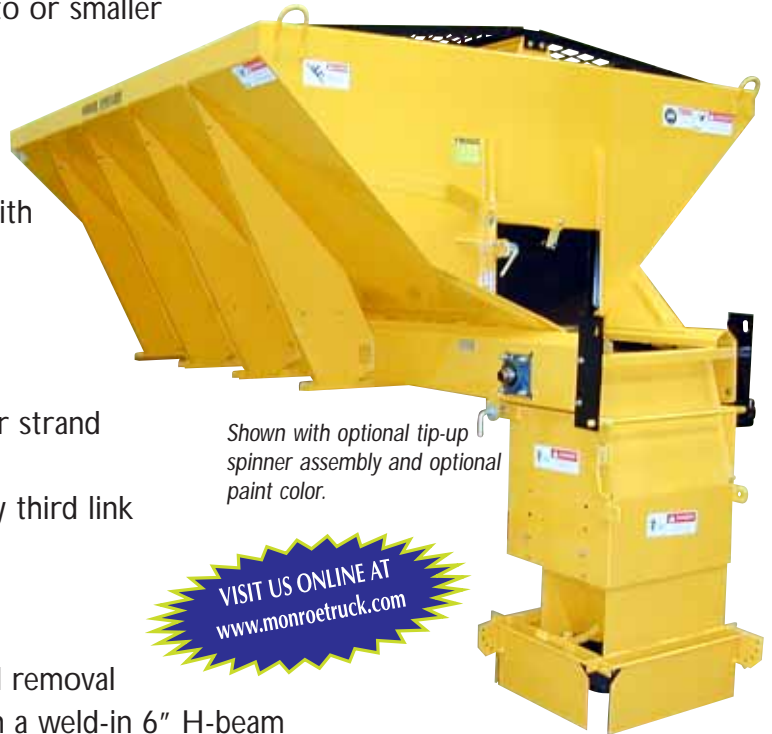
Shown with optional tip-up spinner assembly and optional paint color.