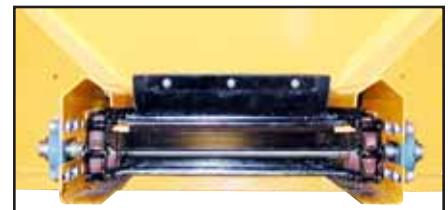
Heavy duty, 10 gauge longsills and floor.

Manufactured by: Monroe Snow & Ice Control 1051 W. 7th Street • Monroe, WI 53566 800-880-0109 • 608-329-8105 608-328-8390 Fax Web Site: www.monroetruck.com E-mail: snowandicecontrol@monroetruck.com