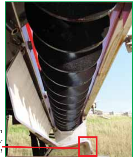
Shown is the Bottom Trough Return Lip for additional Support

New "Z" Latch with Safety Retainer! Easy One Man Latching Without the Use of Tools!