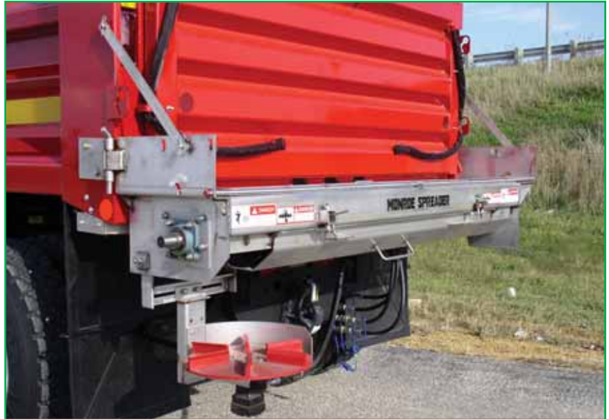
Optional Corrosion-Resistant Stainless Steel shown.