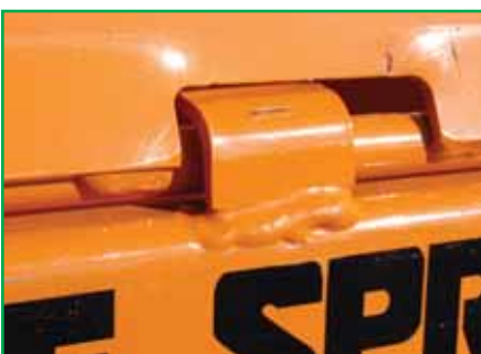
Shown above, is the full opening top lid and full access trough bottom.

Heavy Duty Distributed by: Versatile Reliable