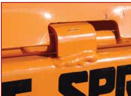
Shown to the left, the retainer for the center of the top cover.

A Division of Monroe Truck Equipment, Inc 1051 W. 7th Street, Monroe, WI 53566 800-880-0109 Fax: 608-328-8390 www.monroetruck.com