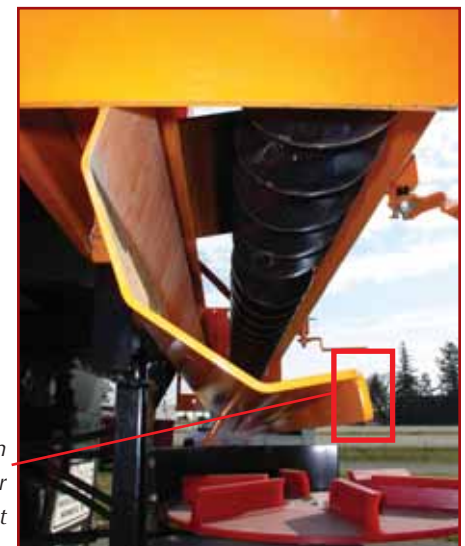
Shown is the Bottom Trough Return Lip for additional Support

New "Z" Latch with Safety Retainer! Easy One Man Latching Without the Use of Tools!