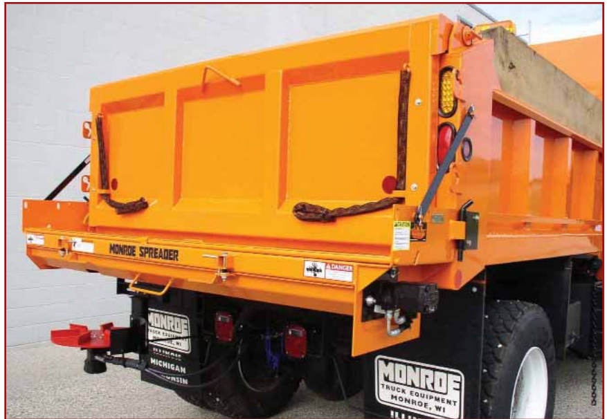
Direct Drive Spreader Shown