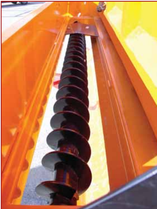
Shown above, is the full opening top lid and full access trough bottom.

Auger is full 7', 6" in diameter, 4" pitch 3/8" thick flighting, welded to a 2 7/8 OD Schedule 40 pipe. Auger shafts are 1 1/4" and supported by heavy duty 1 1/4" sealed, self aligning, relubeable, 2 bolt flanged bearings.