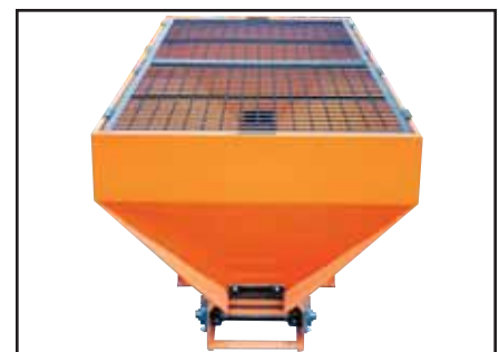
Optional 1/4" or 3/8" rod, set-in top screen.

Manufactured by: Monroe Snow & Ice Control 1051 W. 7th Street • Monroe, WI 53566 800-880-0109 • 608-329-8105 608-328-8390 Fax Web Site: www.monroetruck.com E-mail: snowandicecontrol@monroetruck.com