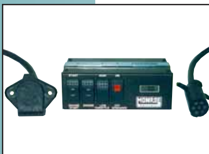
Optional Deluxe Throttle Control.