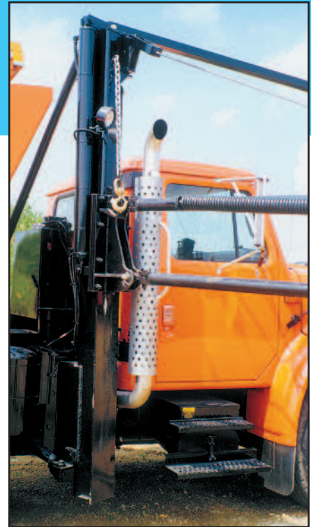
Rear wing post with 3-position adjustable pusharms