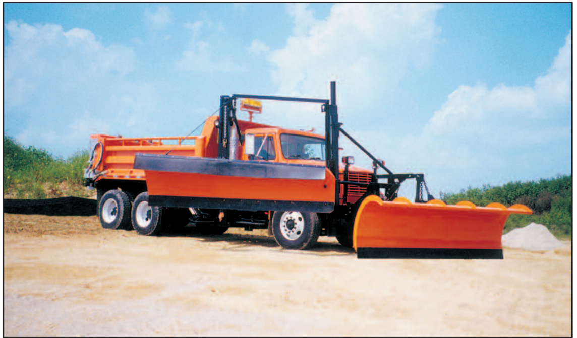
Shown in benching position with optional rubber snow deflector and a Monroe Reversible Snowplow.