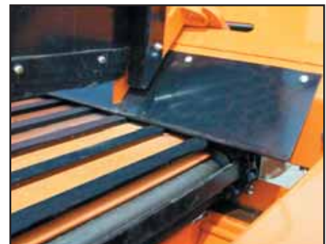
Bolt On Chain Shields