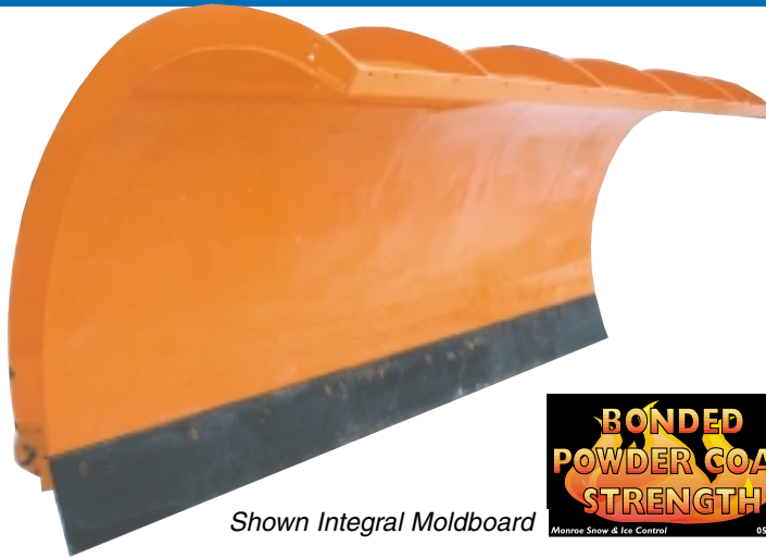
Shown Integral Moldboard