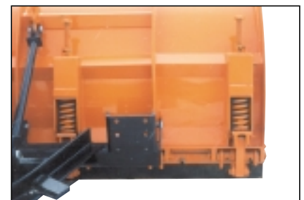
Adjustable Compression Trip Edge