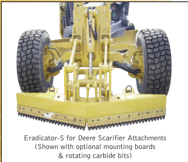
Eradicator-S for Deere Scarifier Attachments (Shown with optional mounting boards & rotating carbide bits)