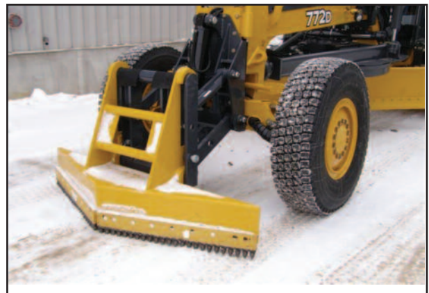
Eradicator-B for Monroe or Balderson Lift Groups Attachments (Shown with optional mounting boards and rotating carbide bits.)