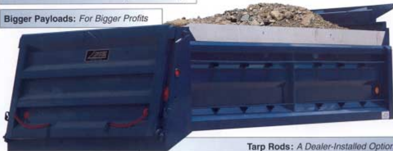
Tarp Rods: A Dealer-Installed Option