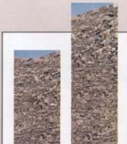
STANDARD STEEL BODY LEGAL CAPACITY

No matter what you haul...sand, gravel, asphalt or dirt, the ParadoxBox will help you haul more load down the road.