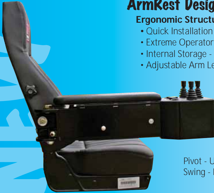
Pivot - Up/Down Swing - Left/Right