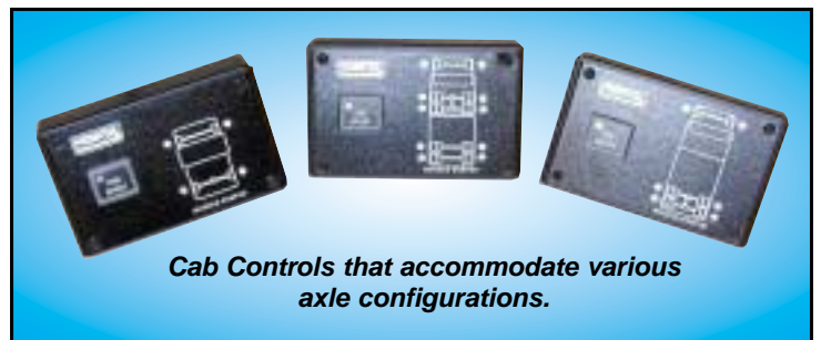
Cab Controls that accommodate various axle configurations.

USA and World Patent Applied for Patent Pending